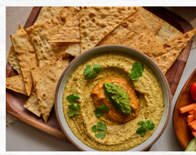
Mediterranean Hummus Platter