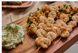
Mediterranean Wild-Caught Shrimp