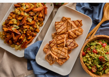
Build Your Own Package