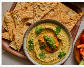
Mediterranean Hummus Platter