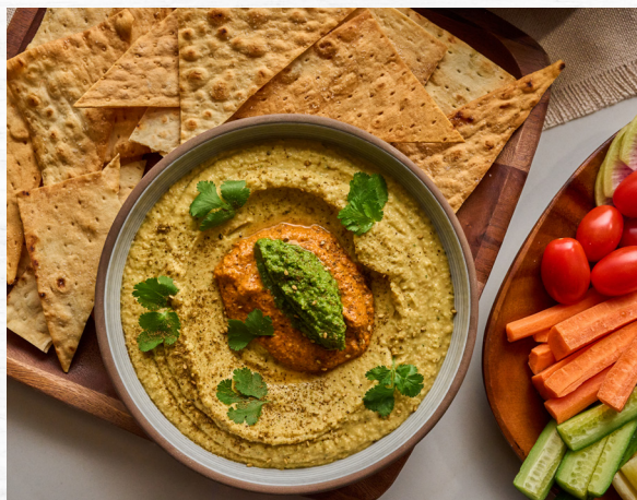
Mediterranean Hummus Platter