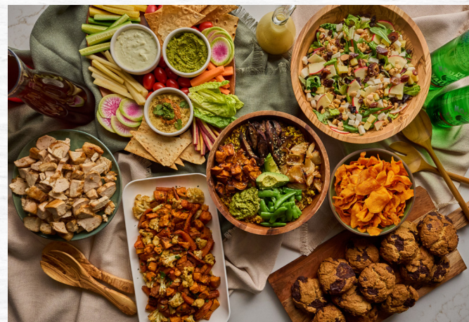
Ultimate Feast Package