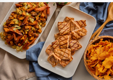
Build Your Own Package

vanilla mascarpone mousse, candied oranges, walnuts